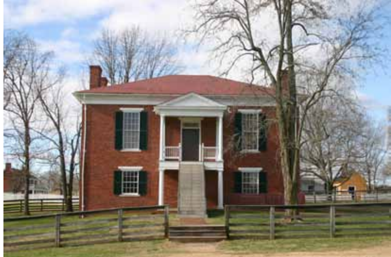
Appomattox Court House saw the last battle of the Army of Northern Virginia and Lee's surrender of to Grant

Our comprehensive tour of Chicago through the Architecture Foundation includes the Loop, Hyde Park, Gold