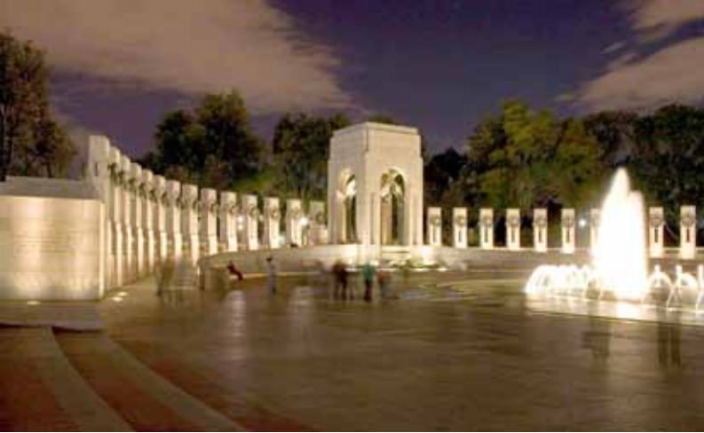
The World War II Memorial on the National Mall

was renowned for its magnificent interior featuring the great clocks, atrium fountains and a breathtaking Tiffany glass dome. This “marble palace” covers an entire city block and rises 13 stories. We’ll have time here for lunch on your own. Next we head to the “Peoples Palace,” now known as the Chicago Cultural Center. Completed in 1897 at a cost of nearly $2 million, it is adorned with sumptuous materials including rare imported marble, fine hardwood, polished brass, mosaics and stained-glass domes. Enjoy a stop at Millennium Park and see “The Bean,” Crown Fountain, or wander through the Lurie Gardens. We will also make stops at The Willis Tower and the French Market so that you can continue sightseeing or shopping on your own if you desire or return to Union Station. The Capitol Limited departs Chicago at 6:40 P.M. (B, D)