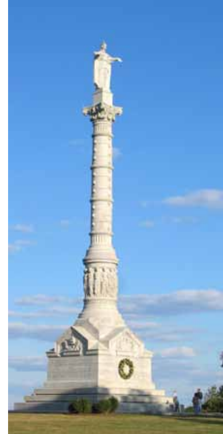
Yorktown Victory Monument

Then fast forward to 1781, the final chapter of the Revolutionary War, as we head to Yorktown. Here the British fortified the port while waiting for reinforcements by sea. A French fleet blocked the British resupply giving Washington and our French allies the opportunity to defeat Cornwallis’ army. The USA was independent. (B, D)