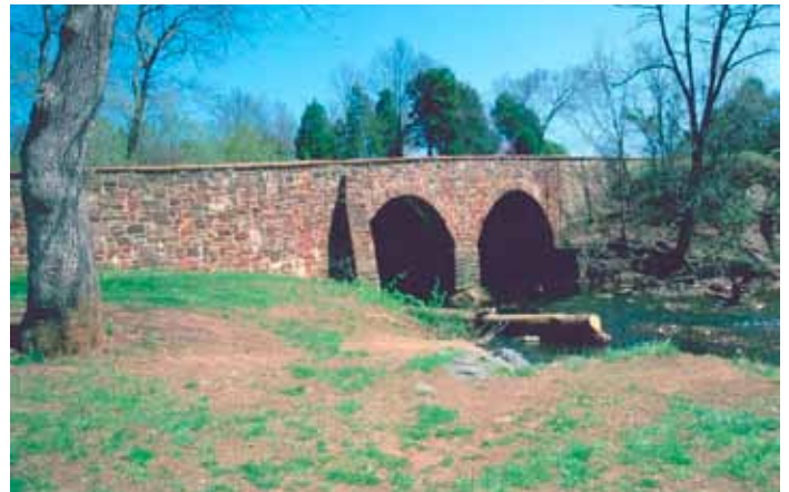
The Stone Bridge at Bull Run