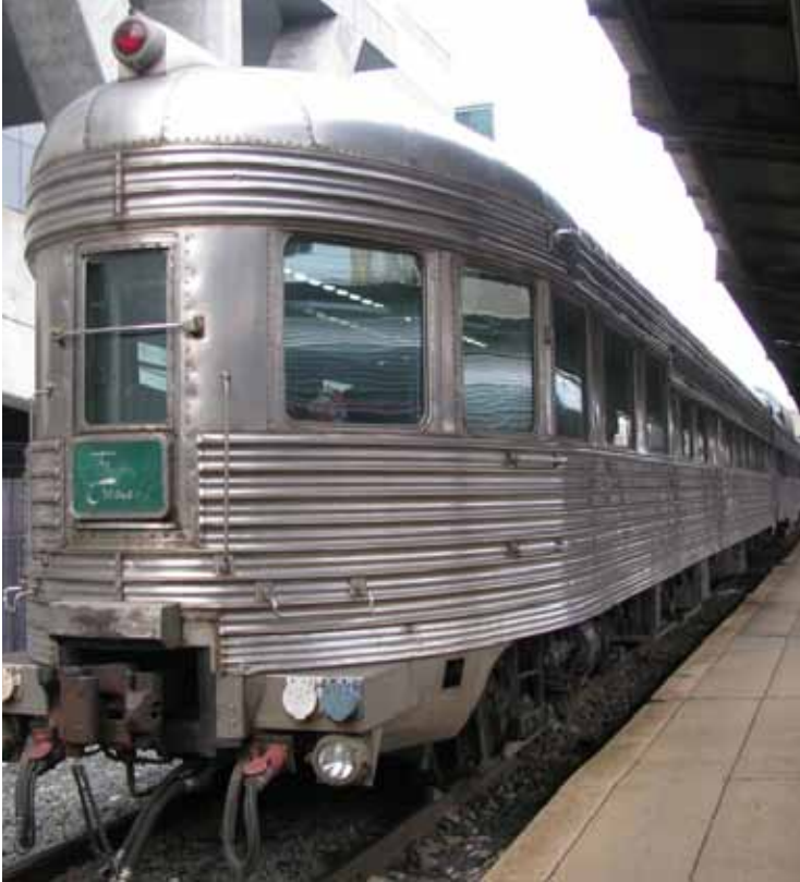
Our lounge car, Royal Street, is at the end of the train

Featuring the Golden Age of Trains & Sesquicentennial of the Civil War's end