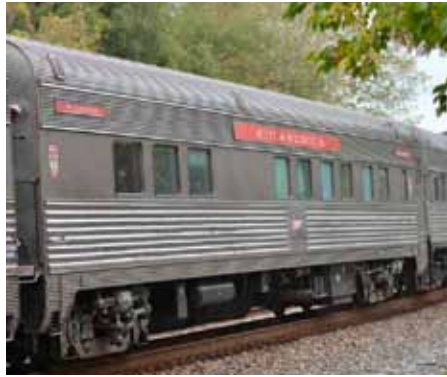
City of Angels (above) is the former New York Central's Laurel Stream with 6 double bedrooms, buffet and lounge built by Budd Co. in 1949.