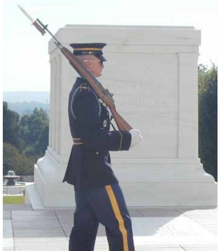
Tomb of the Unknown Soldier, Arlington Cemetery

10 Days, September 4 - 13, 2015 From $3993*